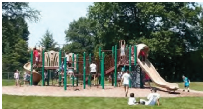
Campers enjoy a fun filled day.

East Windsor Township offers the opportunity to register for our popular camp programs. Information regarding camp and registration procedures can be found at www.east-windsor.nj.us .