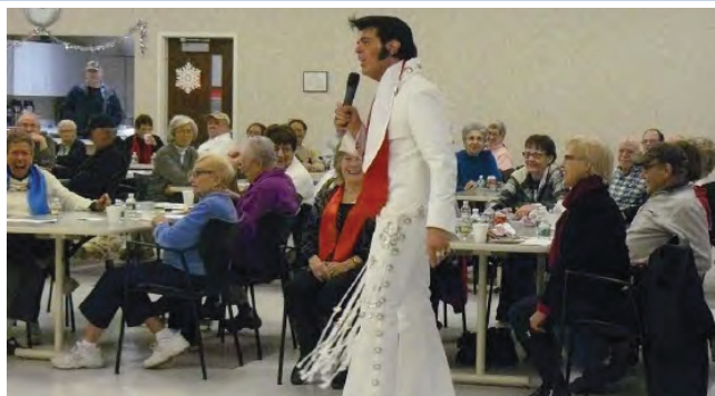
Seniors enjoying an Elvis Presley tribute.