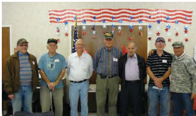
Celebrating our veterans.

Visit the East Windsor Senior Center located at 40 Lanning Boulevard. The state-of-the-art facility has many classes, events and activities to offer senior citizens 60 years old and over who reside in East Windsor or Hightstown. Contact (609) 371-7192 for further information.